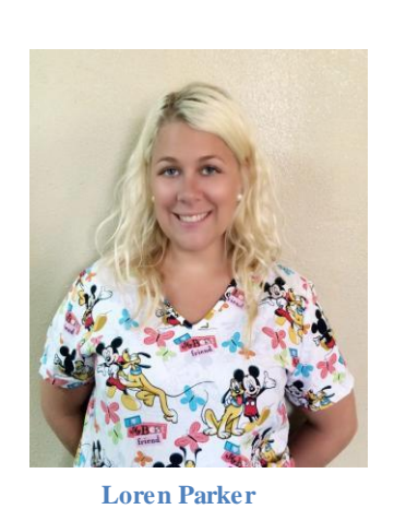
Loren i arkei